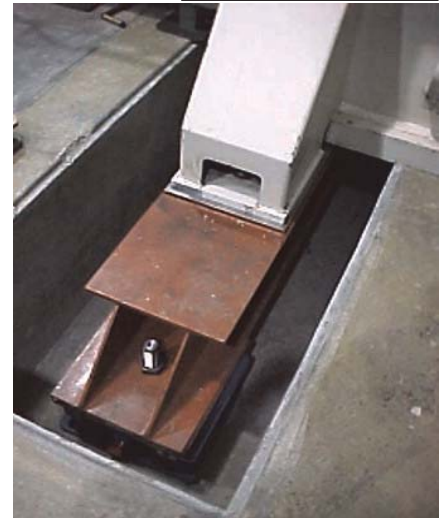
Close-up of an isolator and outrigger beam under a press foot.