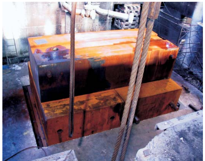
Stacking the Steam Hammer