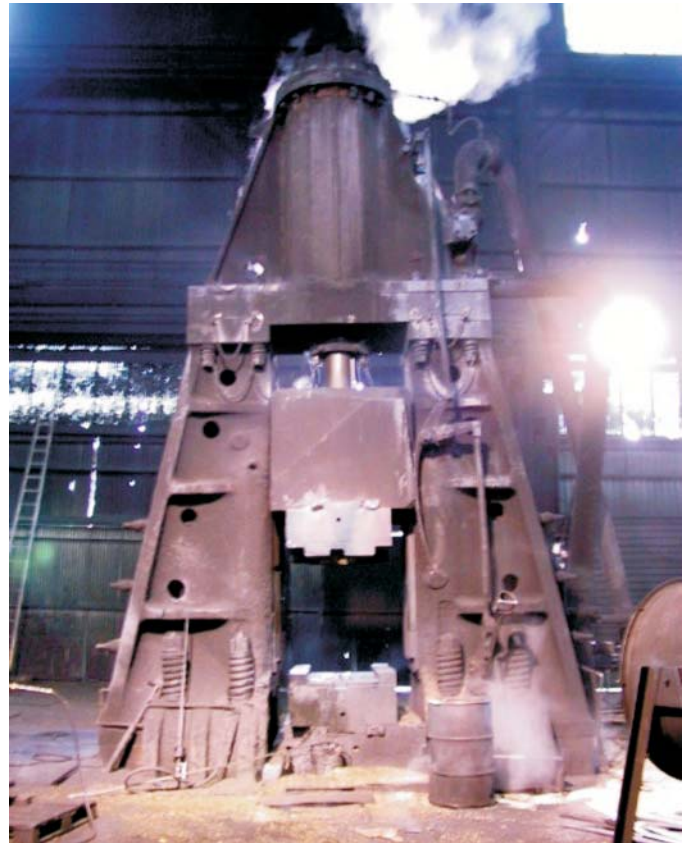
Hammer leaning to the left and front due to foundation failure

Kropp Forge originally installed (2) of these forging hammers in the early 1950's. The two hammers were installed side-by-side in pits with 42' x 36' x 23.5' deep foundations weighing more than 5.5 million pounds each. One of the hammers was later removed and replaced with a 40,000 lb. CECO steam hammer.