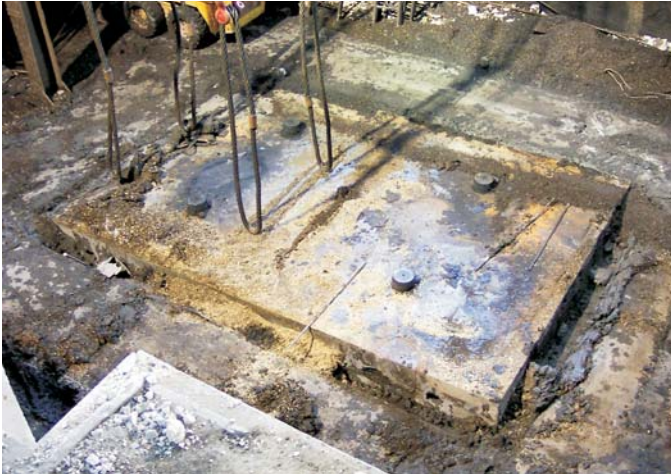
Tilted sub-plate with foundation mass oozing from underneath

The most recent system ( alternating layers of laminated fabric pad material and steel plates ) was installed on top of a mixture of concrete and grout poured into the original pit to compensate for a height difference between the timber/pad system and the new pad/plate system. The material extruded from beneath the hammer was examined and found to be a mixture of concrete, grout, pad material, and water.