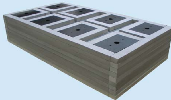
MRM Isolation Elements are Custom Engineered and Sized (Model MRM8x9-1-G shown)