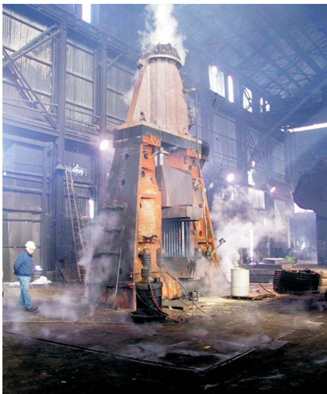
Installation of a 50,000 lb. Erie Steam Hammer Complete!

Vibro/Dynamics has manufactured and supplied custom engineered installation and isolation systems for a wide range of industrial machinery since 1965.