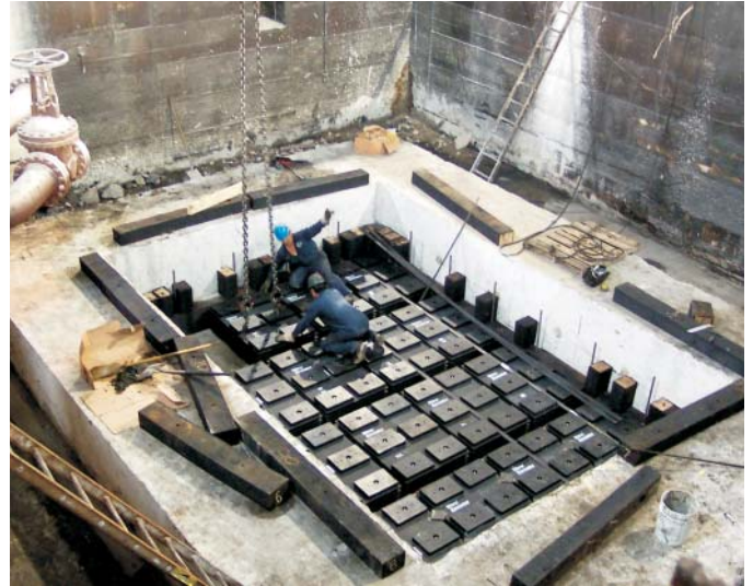
MRM Isolation Elements being placed into pit

The following additional precautions were taken to prevent the elements from shifting under any unanticipated operational conditions: