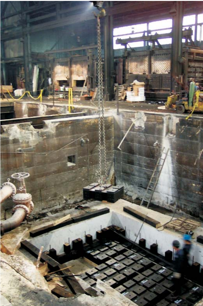
MRM Isolation Elements being lowered into pit using hoist rings

Hoist rings were attached to the lifting bolts on each Element, and then each Element was simply lowered into the pit and placed directly on the concrete foundation. Installation was quick and easy!